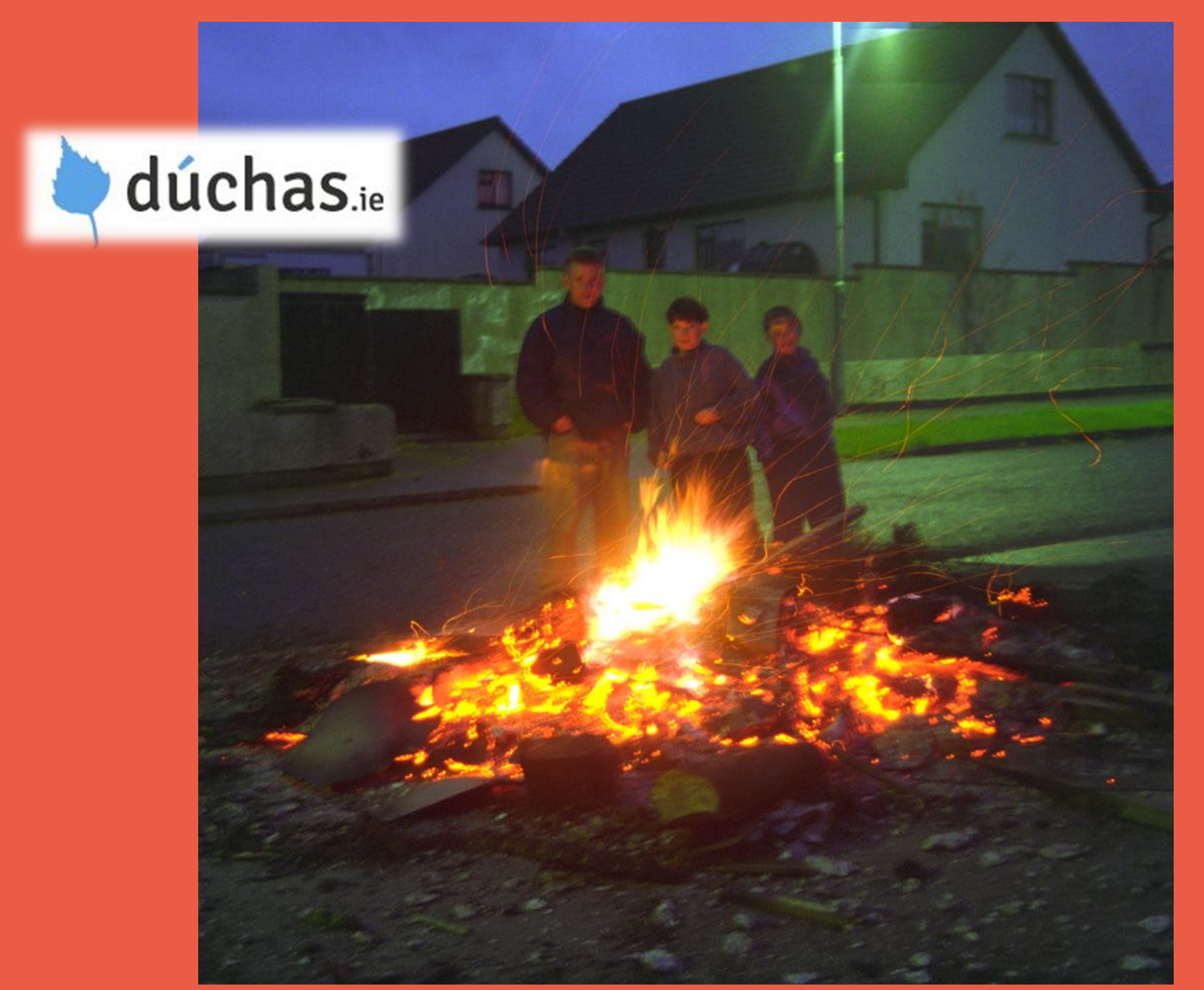
Bonfires on the evening of May Day, Sligo town (Bairbre Ní Fhloinn 1995)