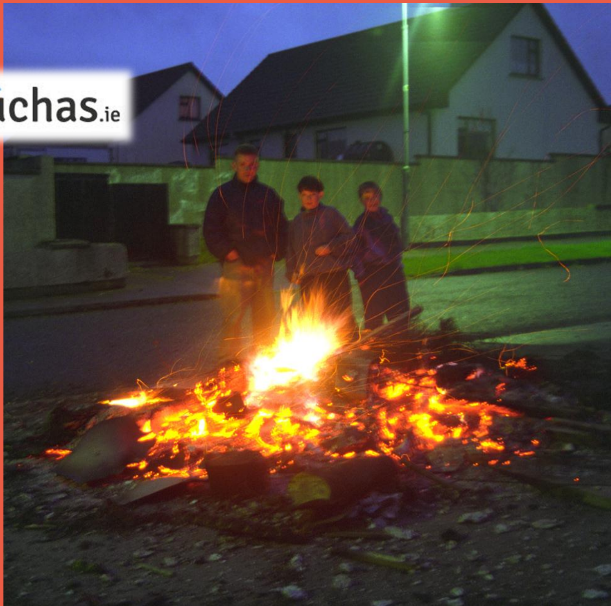
Bonfires on evening of May Day, Sligo town (Bairbre Ní Fhloinn 1995)